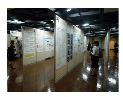
Fig.2 Poster Session Room D